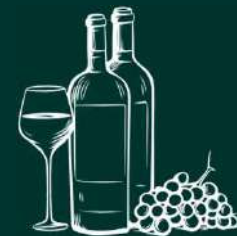
B B B B B B B B B B B B B B B B B B B B B B B B B B B B